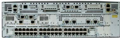
Cisco 3845 Integrated Services Router