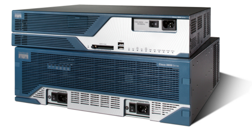
Figure 1. Cisco 3825 and Cisco 3845 Integrated Services Router

Cisco Systems®, Inc. redefines branch office routing with a portfolio of Integrated Services Routers optimized for secure, wire-speed delivery of concurrent data, voice, video, and wireless services. Founded on 20 years of innovation, the Cisco® 3800 Series Integrated Services Routers provide customers with unparalleled network agility, performance, and intelligence. The Cisco 3800 Series transparently integrates advanced technologies, adaptive services, and secure enterprise communications into a single, resilient system. The Cisco 3800 Series routers ease deployment and management, lower network cost and complexity, and provide unmatched investment protection. The Cisco 3800 Series routers feature embedded security processing, generous performance and high memory capacity, and high-density interfaces that deliver the performance, availability, and reliability required for scaling mission-critical security, IP telephony, business video, network analysis, and Web applications in the most demanding enterprise environments. Built for performance, the Cisco 3800 Series routers deliver multiple concurrent services up to wire-speed T3/E3 rates.